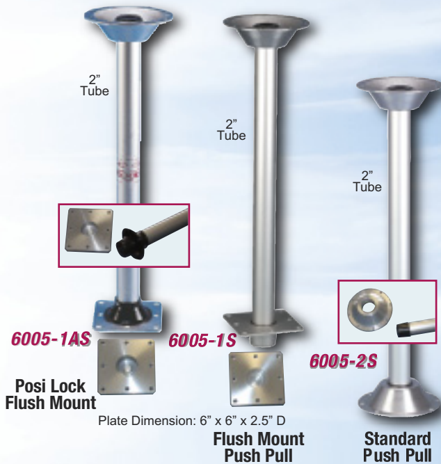
Table Tops "SALTWATER TOUGH"

Made of SURPASS® with 4 recessed cupholders table can be disassembled and stowed in minutes. Hardware attaches to molded-in holes on underside of table. Screws not included. Color: White (Custom colors available, call for quote upon request with high volume orders.)