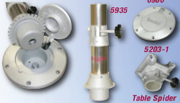
TABLE TOPS & PEDESTALS

Todd's patented Flush Mount Base (#6900) requires either the Todd Adjustable Pedestal (#5935) OR the Todd 15" Fixed Height Pedestal (#5915). Also available for use with this unique system is the Todd 29" Fixed Height Table Pedestal (#6900-29). These Pedestals will accept: Table Spider (#5203-1), Seat Spider (#5203A), or Seat Sliders (#5201A, 6002A)